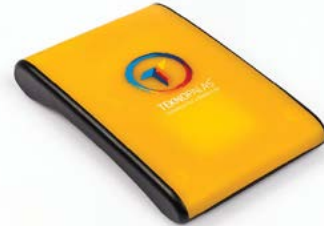
TR100 Desktop Reader